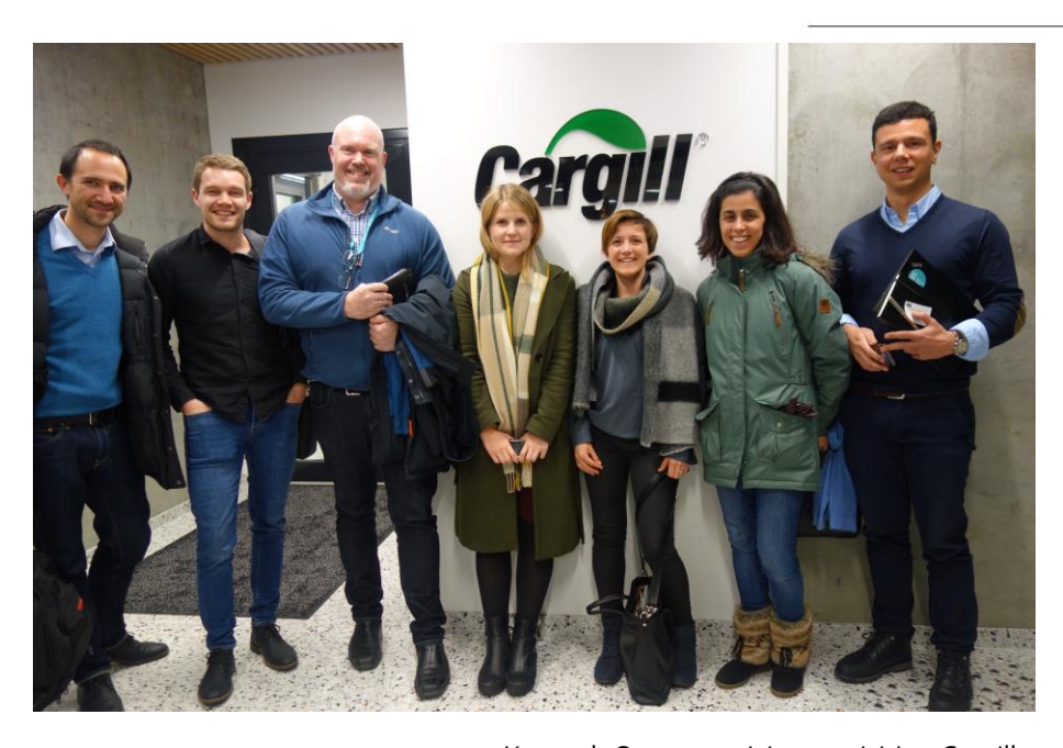
Katapult Ocean participants visiting Cargill.